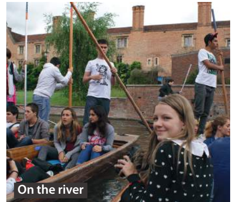
On the river